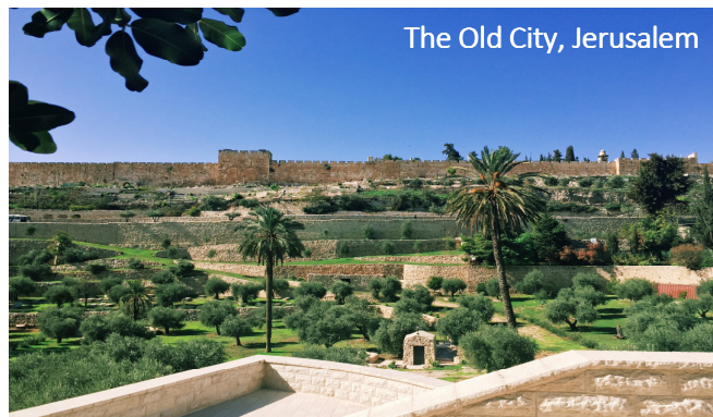
The Old City, Jerusalem

In the morning we will proceed to Bethany, where Jesus rose Lazarus from the dead. We will visit the tomb before we continue on our way passing Wadi Qelt and stopping at St. George's Monastery, the spectacular 6th century cliff hanging complex, with its ancient chapels and gardens still active and inhabited to this day. The valley parallels the Old